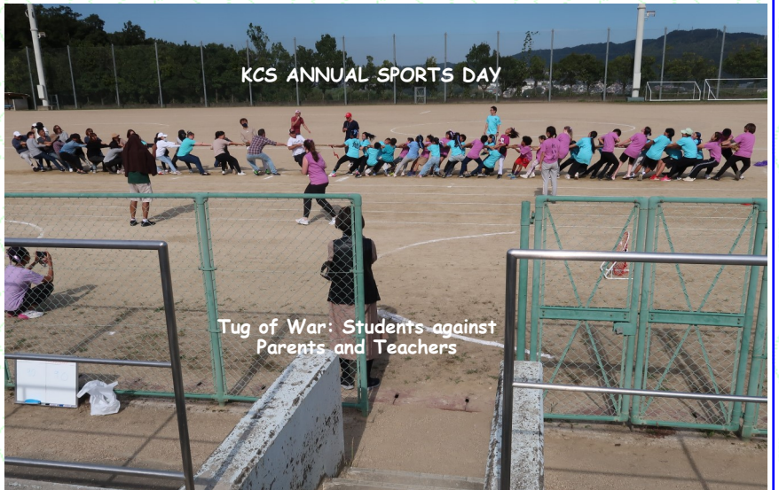
KCS ANNUAL SPORTS DAY

We forgot to mention this, but at the end of last school year, three of our KCS people (two high school students and a mom of two of our younger students) were baptized! One of our board members and family have started a congregation in Heguri, where the school is located. The community is being reached and the baptisms were held there in a portable baptistery.