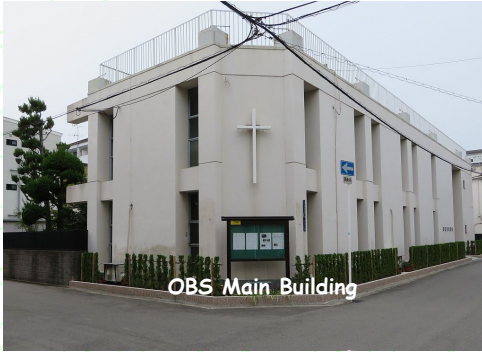
OBS Main Building