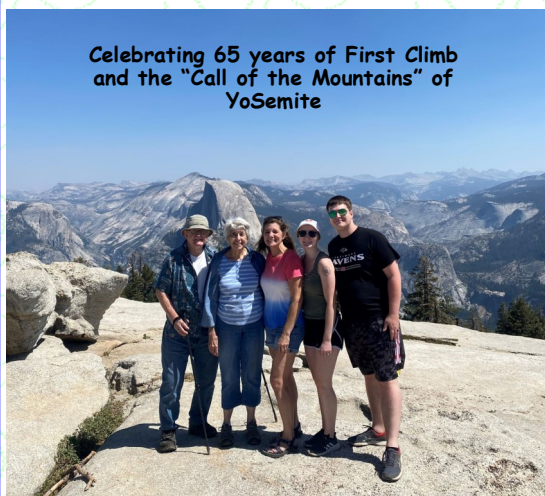
Celebrating 65 years of First Climb and the "Call of the Mountains" of YoSemite

We are always encouraged to see how God has used those with whom we have had special relationships! We