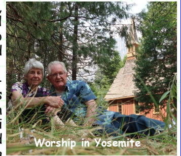
Worship in Yosemite

OUR TIME IN THE STATES was very stressful, but filled with wonderful visits, just not relaxing: STUFF and changing plans always came with God's protection and blessing! Isn't that how life is? Shalom! We are happy to be back in Japan and glad to be released from "home imprisonment" (14 days of quarantine)! We are healthy and have had time to catch up on different projects and reading.