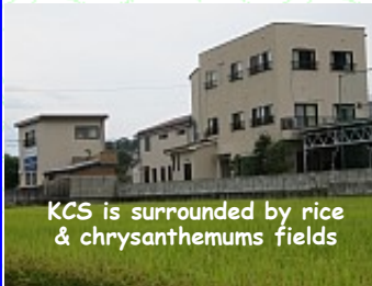
KCS is surrounded by rice & chrysanthemums fields

KANSAI CHRISTIAN SCHOOL is going well this year again. Because of the cautionary measures taken in regard to COVID-19, our new teacher has not been able to come to Japan until this month. We were delighted that he was able to test negative and fly within 72 hours, as well as testing negative in Japan. The chairman of our board drove to Tokyo (about an 8-hour drive) to bring him to Osaka (a COVID-19 necessity). He has been preparing for his classes, but has been a bit bored waiting out the 14-day quarantine here. He will begin teaching tomorrow. Our staff, especially our principal, who have been teaching his classes will be very happy when he can begin his classes.