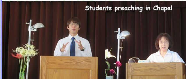
Students preaching in Chapel