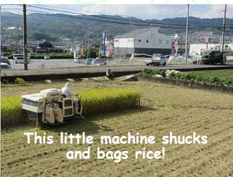
This little machine shucks and bags rice!