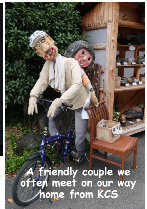
A friendly couple we often meet on our way home from KCS