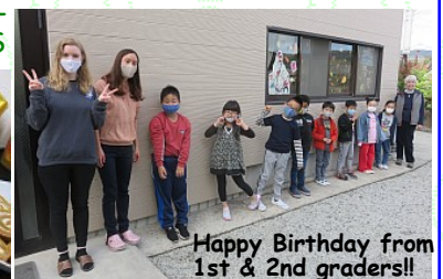
Happy Birthday from 1st & 2nd graders!!

Personal Support: Osaka Bible Seminary PO Box 1697 Columbia, MO 65205