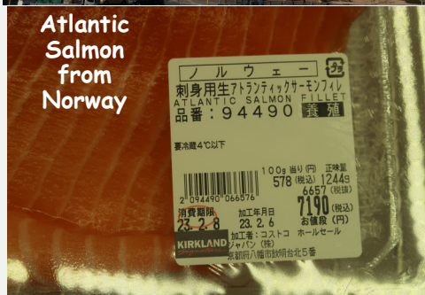
Atlantic Salmon from Norway

ノルウェー産 刺身用生アトランティックサーモン ATLANTIC SALMON FILETS 品番: 94490 産地 要冷蔵4℃以下 100g 単位 正味量 578 (税込) 1244g 6657 (税別) 2-092490-066576 加工年月日 7190 (税込) 消費期限 23.2.6 消費期限 (円) 23.2.8 加工者: コストコ ホールセール KIRKLAND ジャパン (株) 京都府八幡市南町四丁目七番