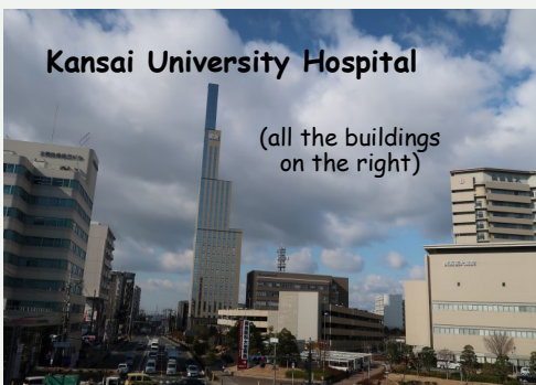
Kansai University Hospital

The picture below, is of our hospital where we have both "served time." Kansai University Hospital is only a 10-minute drive from our home and is rated among the top hospitals in the world and No. 1 in Japan. We can see the tower building from our house. It is actually the hospital's "hotel" for families who need to stay when their family member has been admitted to the hospital. KUH is part of a university campus where they train students who are medical majors. We have both had surgeries and multiple day stays at the place I call our "beso" (vacation home). A "God thing"—we have been here 37 years and 10 years ago God provided this wonderful hospital close by.