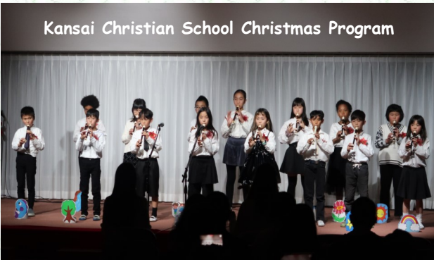
Kansai Christian School Christmas Program

DECEMBER , like in the U.S., is a busy month for Christians here in Japan as we celebrated God's sending His Son to earth to show us the way back to Him. Church groups and schools, like Kansai Christian School, have programs that often attract those who are seeking more than a humdrum life of work or school. KCS had a well-attended program with all of the students participating in an un-believable number of