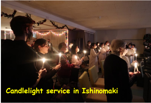
Candlelight service in Ishinomaki