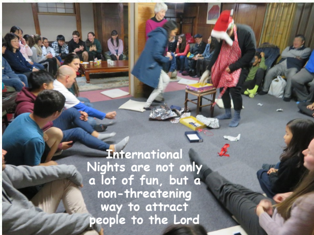
International Nights are not only a lot of fun, but a non-threatening way to attract people to the Lord

INTERNATIONAL NIGHTS! We plan to start our International Nights again on February 4th! Because of COVID-19, we haven't had these home parties for about three years. People have kept asking us when we will start up again. These are parties held on the first Saturday of the month in our large basement. We have games to get acquainted, then other fun group games. Following the games we have refreshments and fellowship time (including ping-pong), then I give a short Gospel message. Some have become Believers as a result of these outreach parties. Usually, around 35-40 people of all ages attend.