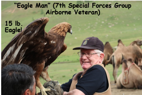
“Eagle Man” (7th Special Forces Group Airborne Veteran)

After we arrived back at the venue, some others and I were taken up to a crystal mine beyond our resort no longer in use. I found some nice pieces!