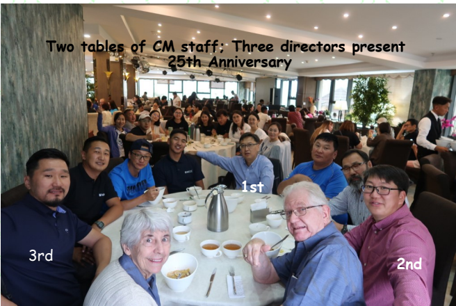
Two tables of CM staff: Three directors present 25th Anniversary