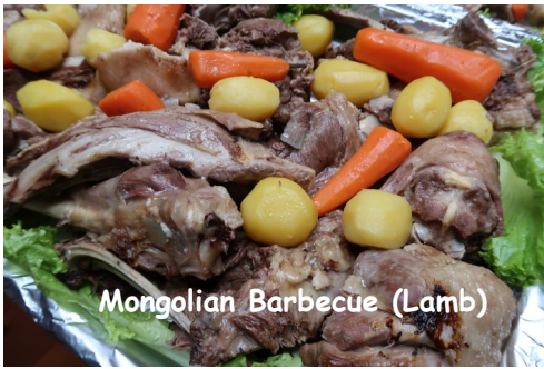
Mongolian Barbecue (Lamb)

Real Mongolian Barbecue meat is usually sheep meat or goat meat. This time it was sheep meat—and you eat it with your hands (no utensils, just sharp knives for cutting)!