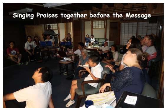
Singing Praises together before the Message