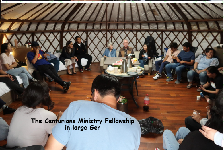
The Centurions Ministry Fellowship in large Ger

Christians in Mongolia. They are very evangelistic—telling the Good News every chance they get!