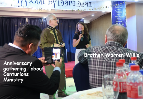
Anniversary gathering about Centurions Ministry