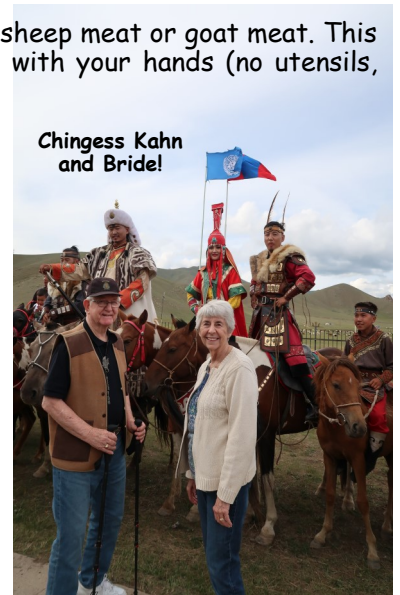
Chingess Kahn and Bride!

We also got to “play” one afternoon when we were taken to a horse show in a rodeo-like arena depicting the life of Chingess Khan. It was an amazing hour-long show put on by young people doing tricks on their horses as they portrayed the story! They must have been worn out by the end of the show, but they all posed for us!