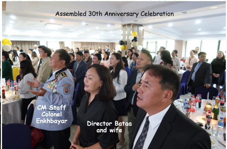
Assembled 30th Anniversary Celebration

percentage is higher than that of Japan! Christians around the world could learn a valuable lesson from the constant witness and outreaches of the