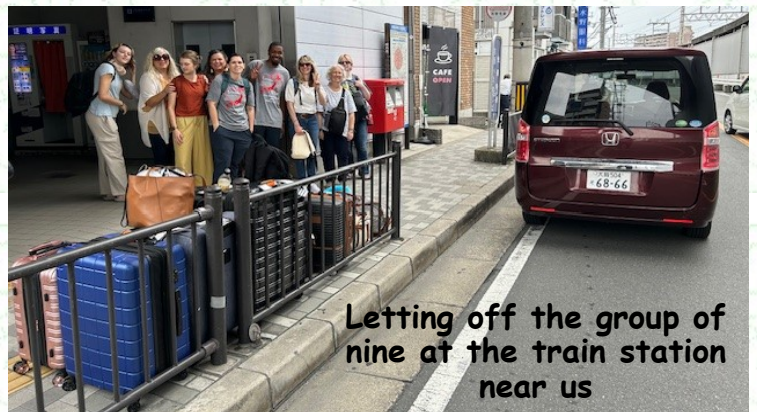
Letting off the group of nine at the train station near us

LOTS OF COMPANY! This month we entertained a wonderful group of nine people from Eastern Tennessee for four days. They were from different congregations in that area, and when they came from Nagano to the Osaka area, they used our home as headquarters for their various outreaches. Our car made several trips back and forth carrying the luggage and the team.