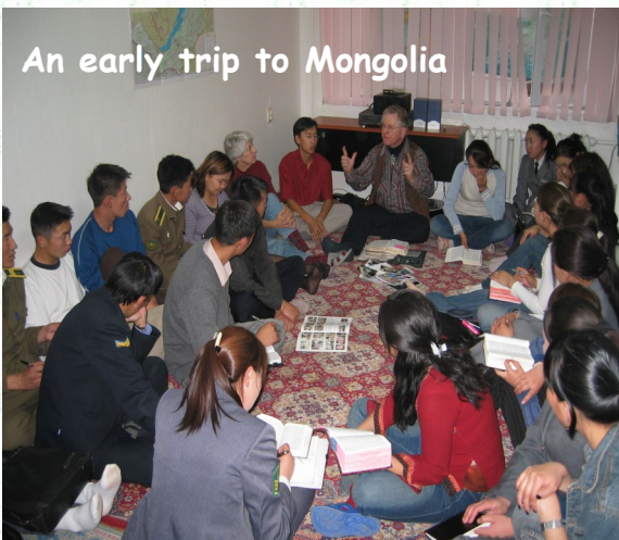
An early trip to Mongolia

The way our workers, by the grace of God, continue to bring other Mongolians to the Lord excites us, especially because there are very few numbers of conversions here in Japan. When they happen, they are certainly wonderful!