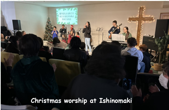
Christmas worship at Ishinomaki