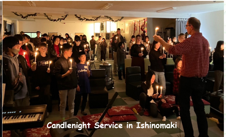
Candlelight Service in Ishinomaki