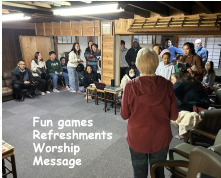
Fun games Refreshments Worship Message

Because of our not having International Nights during COVID and our nearly three months in the U.S. (July-September) last year, it has been a bit difficult to get back to our normal schedule of International Night being on the first Saturday night of the month. In December, other Christmas events made it necessary to change to the second Saturday night and we had only 13 at the party. HOWEVER, it was one of the best International Night times we have ever had! Our last guest didn't leave until about 1:30 a.m. and the time with him was especially important as well as our enjoyment of having that time together.