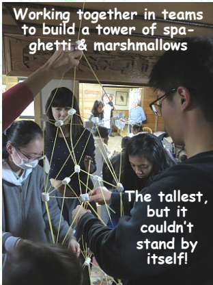
Working together in teams to build a tower of spaghetti & marshmallows