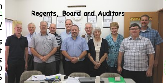
Regents, Board and Auditors