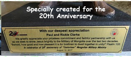
Specially created for the 20th Anniversary

Personal Support: Osaka Bible Seminary PO Box 1697 Columbia, MO 65205