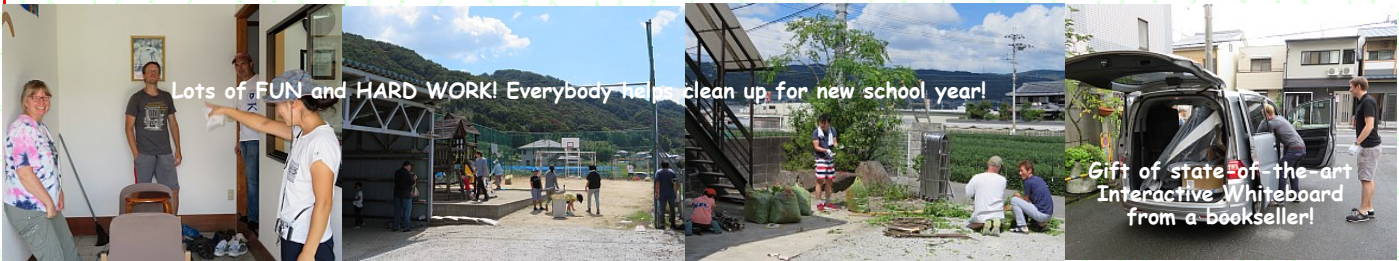
Lots of FUN and HARD WORK! Everybody helps clean up for new school year!

KCS is growing and the elementary classrooms are "full to the brim!" All students study Bible every day, and love to sing in chapel on Fridays. They listen intently to the messages. Please pray that KCS will be even more effective as we have this opportunity to share God's