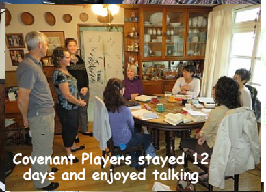
Covenant Players stayed 12 days and enjoyed talking

This month has been extremely busy with many activities and guests in addition to our usual work. The Covenant Players worked with the KCS students again. We are leaving in a couple days for the International Conference on Missions (ICOM) in Peoria, IL, and will also visit three different congregations in three states, plus three quick stops to visit family in two other states! We look forward to participating in the ICOM which is featuring JAPAN this Year! It will be our first visit to the States together during a school year and our first time to be at a missions conference in over 30 years! We look forward to seeing many of you in the Midwest in November!