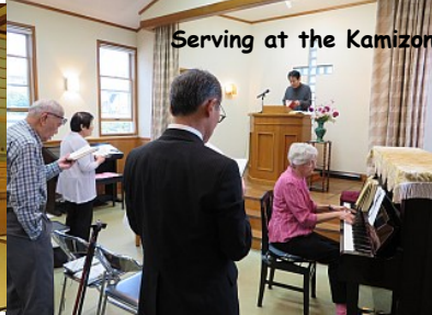
Serving at the Kamizono congregation