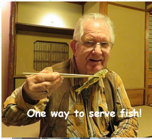
One way to serve fish!