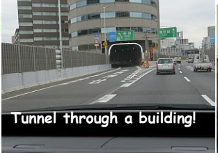
Tunnel through a building!