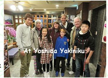
At Yoshida Yakiniku