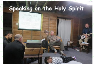
Speaking on the Holy Spirit