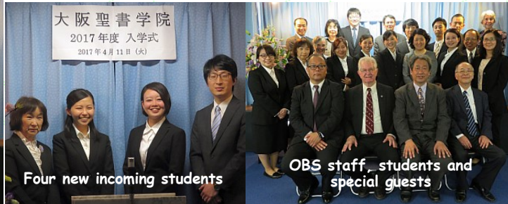
Four new incoming students