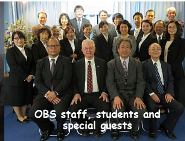
OBS staff, students and special guests

students who are eager to study at OBS. With several online degree students and some auditors, for the first time in many years we have a "large-for-Japan" student body of 17 students! Pray for a continued increase!