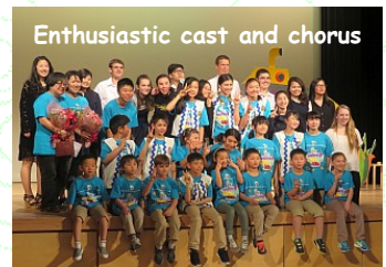
Enthusiastic cast and chorus